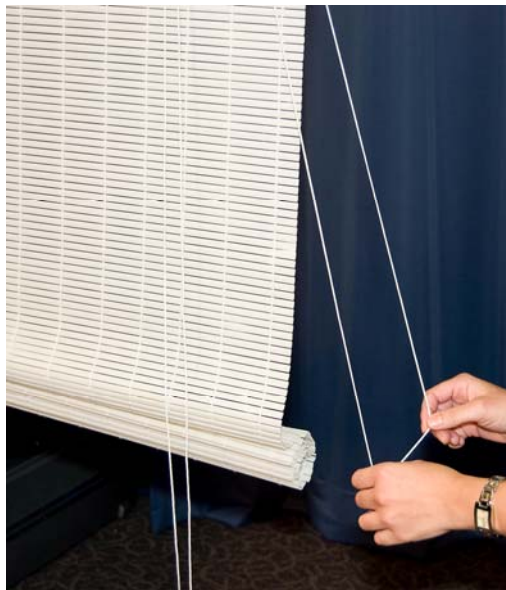
1/4" Oval Roll-up Blind

5457 between 8 a.m. and 5 p.m. PT daily, or visit the firm's Web site at www.lewishymaninc.com/recall .