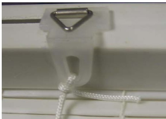
Roll-up blind without release clips Included in this Recall